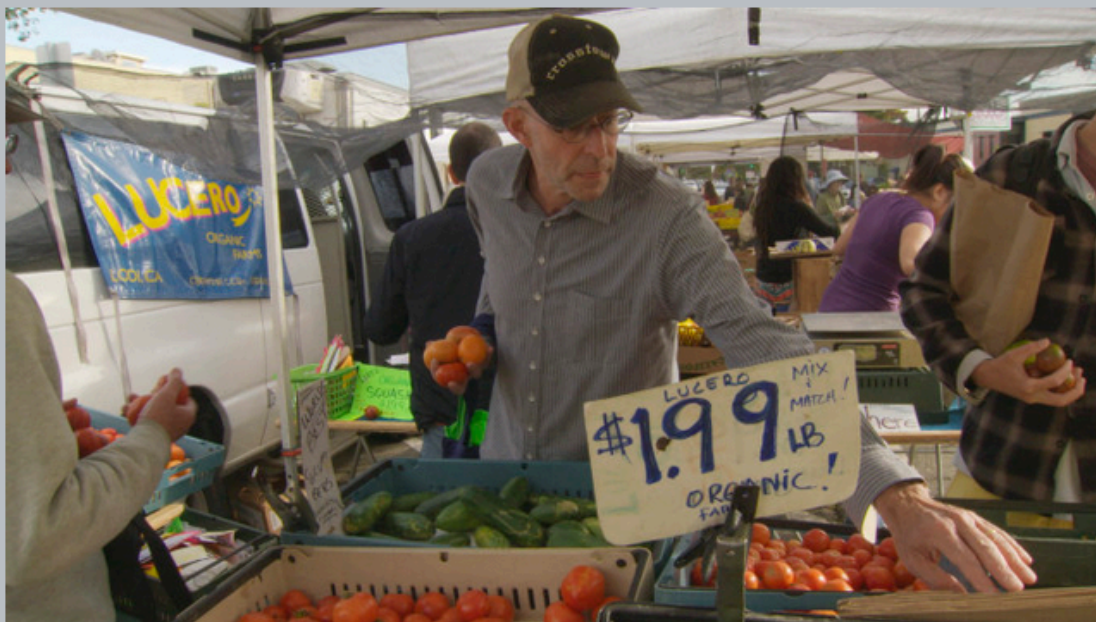
Michael Pollan at a farmer's market.

Pollan's journey of discovery takes him from the plains of Tanzania, where one of the world's last remaining tribes of hunter-gatherers still eats the way our ancestors did, to Loma Linda, California, where a group of Seventh Day Adventist vegetarians live longer than almost anyone else on earth, and eventually to Paris, where the French diet, rooted in culture and tradition, proves surprisingly healthy. Along the way he shows how a combination of faulty nutrition science and deceptive marketing practices have encouraged us to replace real food with scientifically engineered "food-like substances."